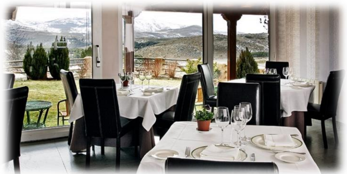
Hotel El Milano Real