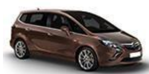
Opel ZAFIRA or similar