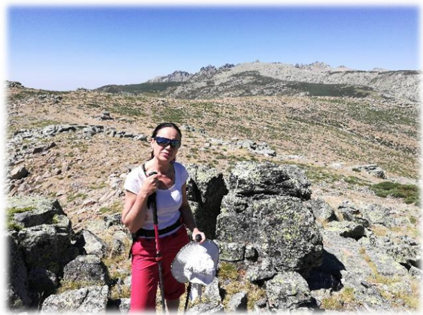
The peaks of the Cirque in the distance