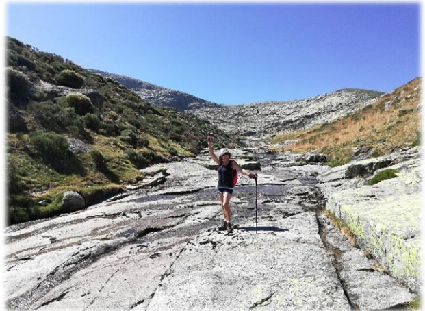
Glacier carved valleys