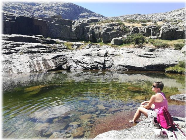
Crystalline mountain ponds