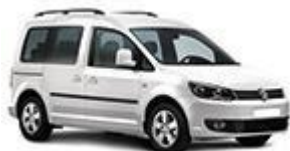
Volkswagen CADDY or Similar

Please make sure when renting a car, you are clear on your options: kilometres permitted for your rate, insurance coverage (basic 3 rd party is always included), gas/diesel refill options. Remember most cars in Europe are standards (manual) and you must specify if you need an automatic car. Often these are not readily available. Also ensure you have a car big enough for bike boxes if you decide to BYOB and luggage. Models like the Opel Zafira, Volkswagen Caddy or the Peugeot Partner, Citroen Berlingo are great options as they are only a bit bigger than a car but have better luggage space. See pictures for reference: