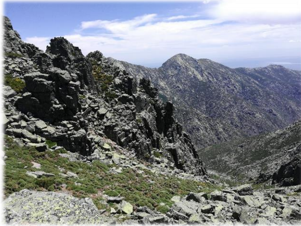
Looking down into Los Galayos from the North Side